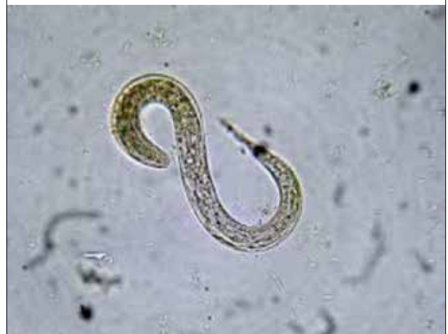
Fig. 3. Larva of Strongyloides stercoralis .