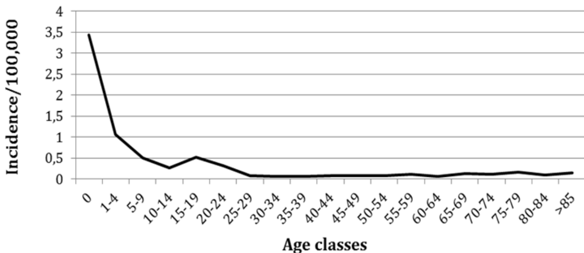
Fig. 2. Estimated incidence of invasive MenB disease in Italy, 2007-2012 (data from reference 16).

Carrier status has been studied and even more in depth understood during last years, in particular after the implementation of immunization with MenC conjugate vaccine