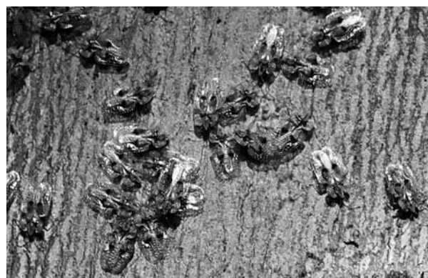
Fig. 1. Adult specimens of Corythuca ciliata.

In August 2011 a 23 year old man and 18 year old woman residing in the ASL CN1 Health Services Offices territory presented at the emergency department of the local hospital after having developed a rash during the previous night on the hands, neck and head which was