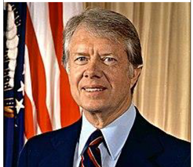
Fig. 4. James Earl Carter Jr., Jimmy Carter** – Plains, 1 o October 1924.

** Jimmy Carter served as the 39th President of the United States from 1977 to 1981. He was awarded the 2002 Nobel Peace Prize for work to find peaceful solutions to international conflicts, to advance democracy and human rights, and to promote economic and social development.