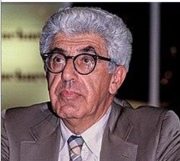
Fig. 1. Barry Commoner* - The proper use of science is not to conquer nature but to live in it.

* Barry Commoner (May 28, 1917 – September 30, 2012) was an American cellular biologist, college professor, and politician. He was a leading ecologist and among the founders of the modern environmental movement.