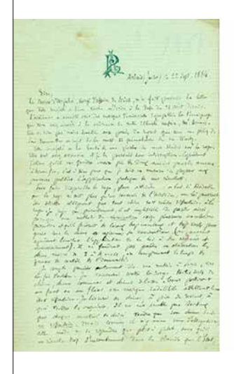
Fig. 5. Letter from Pasteur to Dom Pedro II, asking the Emperor to allow him to test the vaccine against rabies in those sentenced to death. Credit: Arquivo Histórico - Museu Imperial, Maço 192 - Doc. 8722, 23/06 e 22/09/1884 [11].